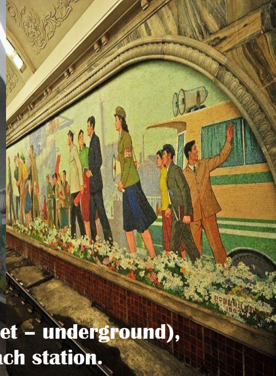
One of the deepest metros in the world (over 110 meters – 360 feet – underground), Pyongyang metro displays stunning mosaics and chandeliers in each station.