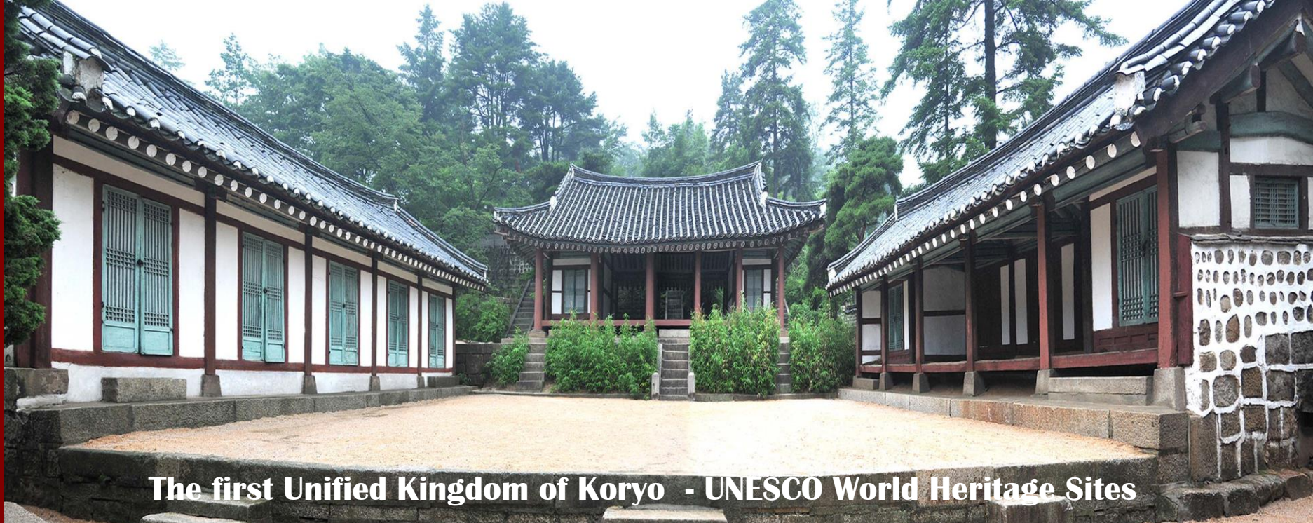
The first Unified Kingdom of Koryo - UNESCO World Heritage Sites