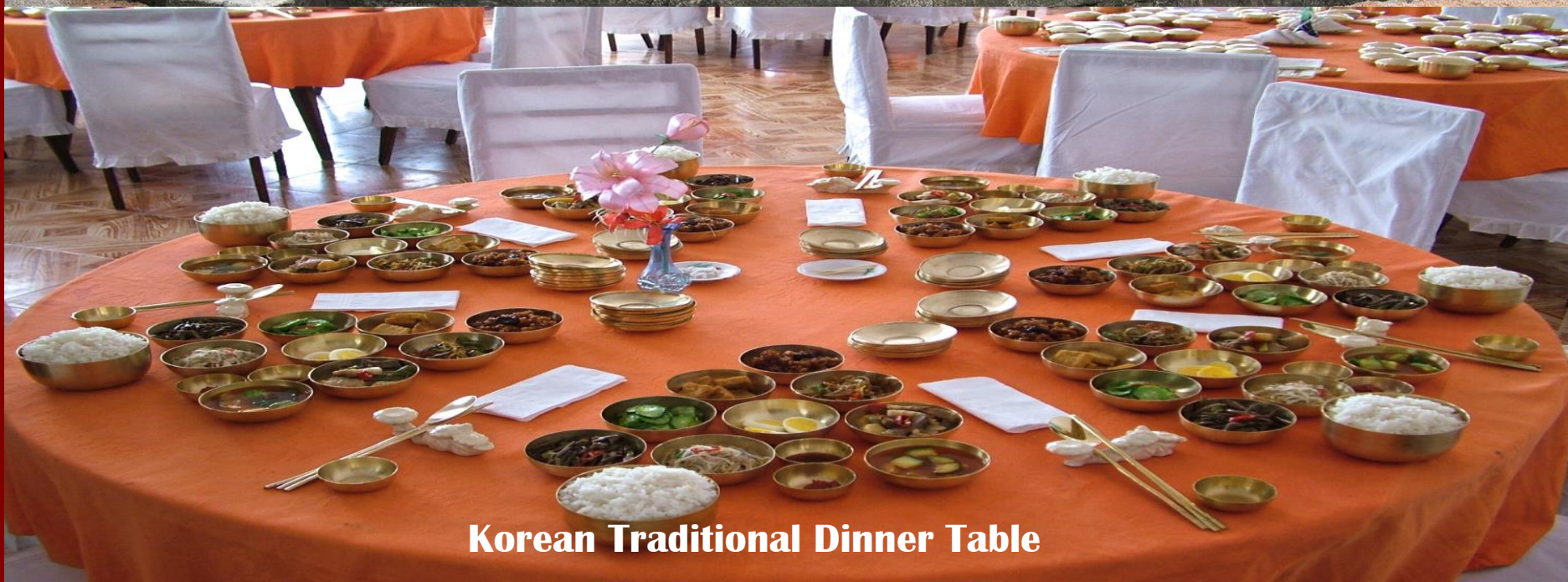
Korean Traditional Dinner Table